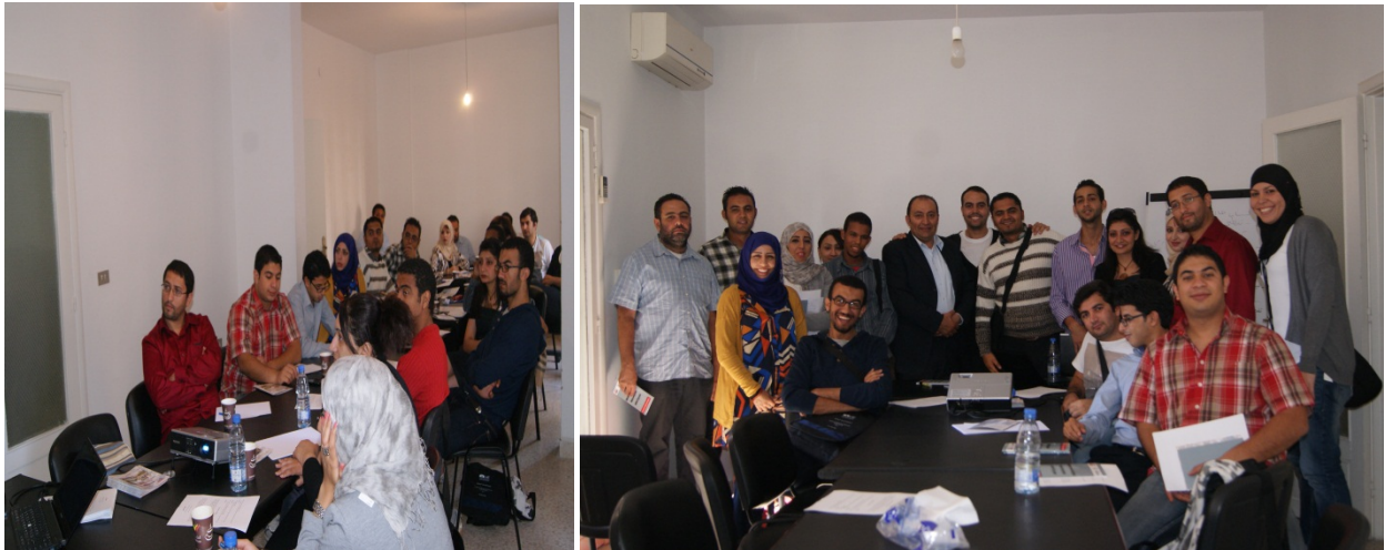
LDF Group at the Syndicates Training Center