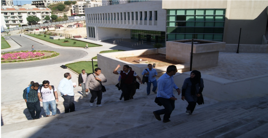
LDF Group at LAU Byblos Campus