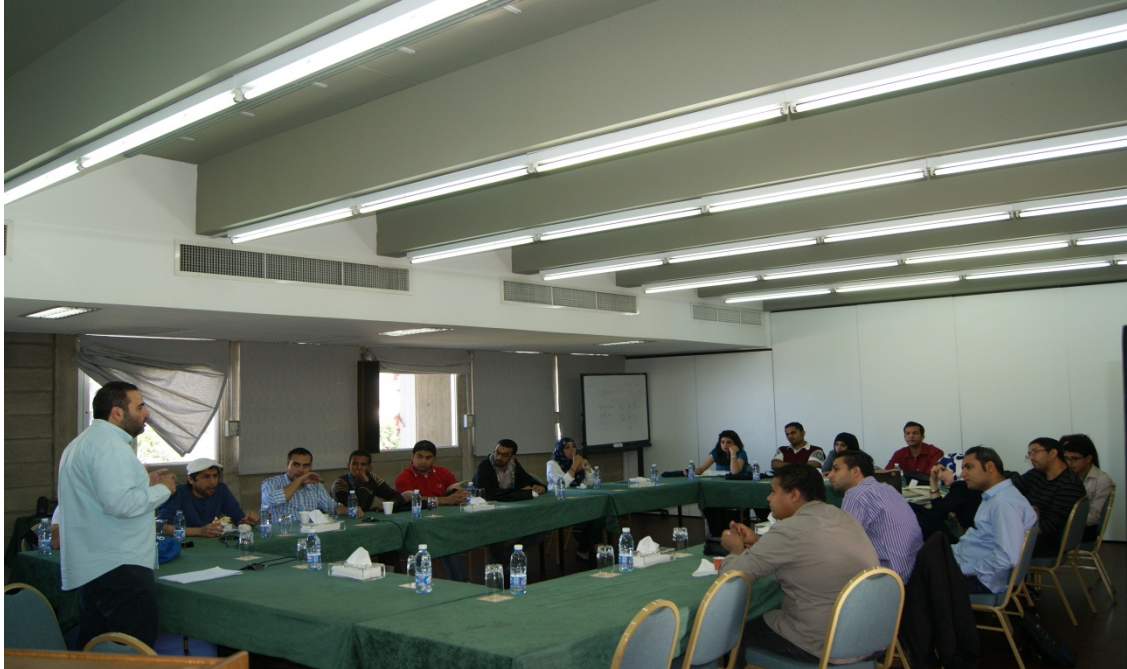
LDF Group At Byblos Campus